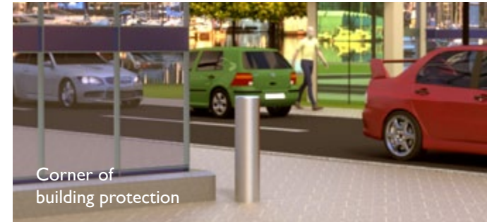
Corner of building protection

An illustration on the various ways PAS 68 Static Bollards can be integrated into the Streetscape.