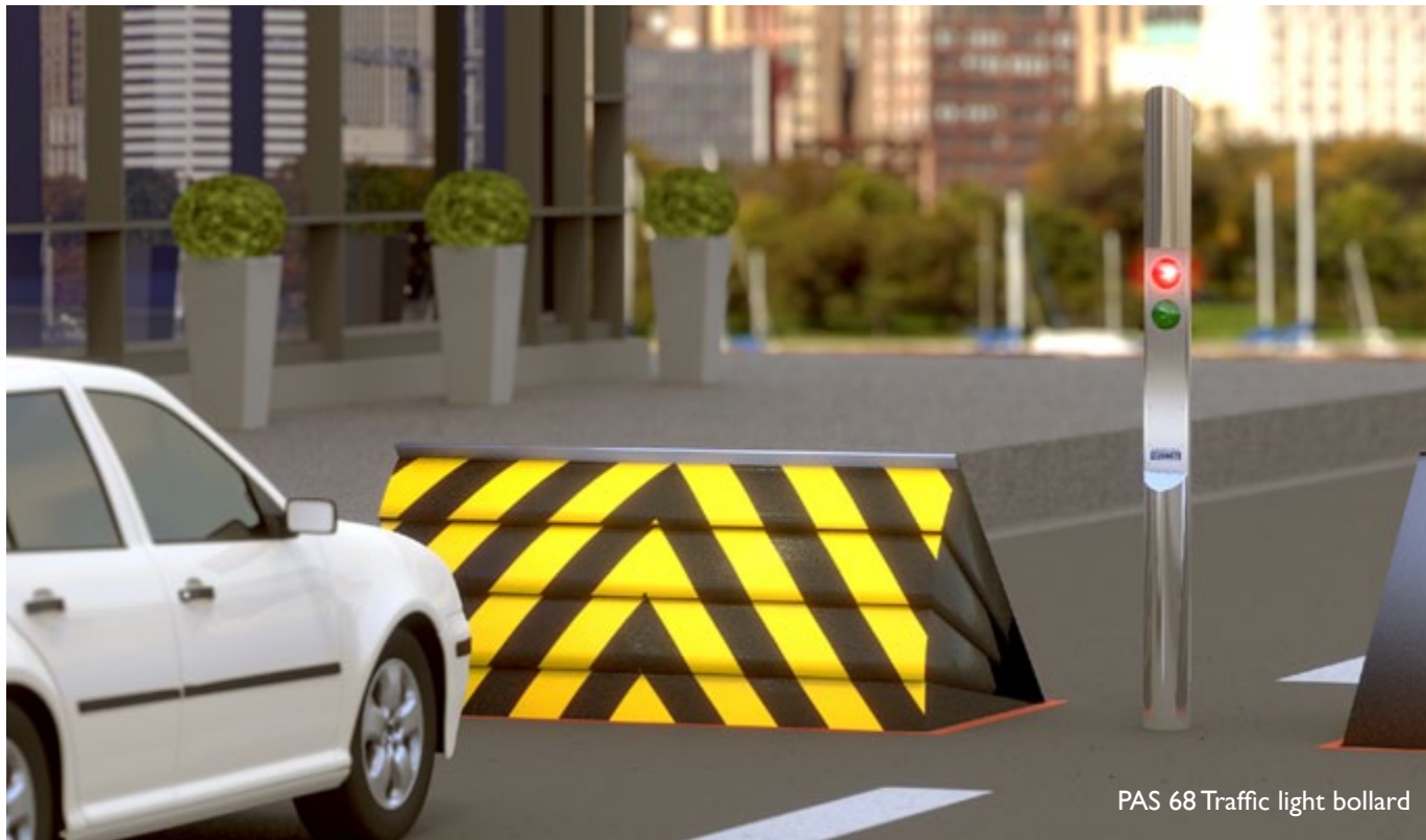
PAS 68 Traffic light bollard