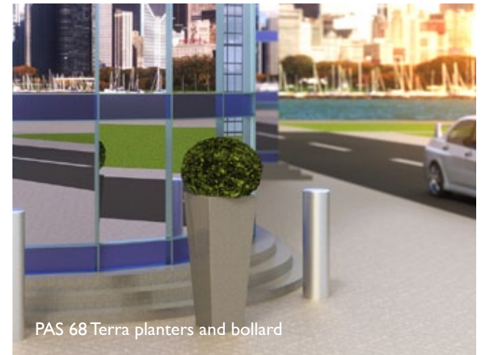
PAS 68 Terra planters and bollard